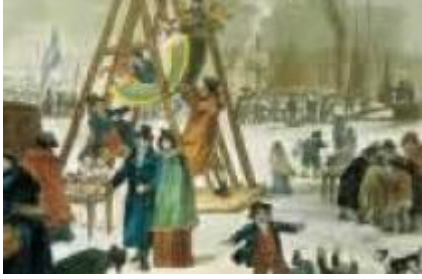
Frost Fairs [3]